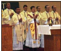
8 priests concelebrated All Soul's Mass at Pius X on November 2, 2010.