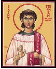
Saint of Forgiveness St. Stephen The First Martyr December 26, 2010