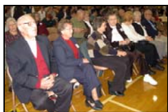
Over 50 guests attended the Mass and reception.