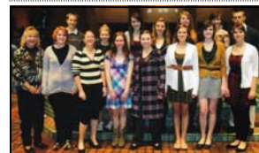
Mrs. Imler's French 4 class