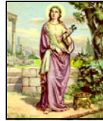
St. Agnes of Sicily February 5, 2011