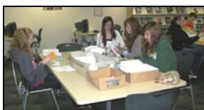
Pius X student volunteers worked hard to help us process our mailings.