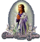
Saint of Forgiveness