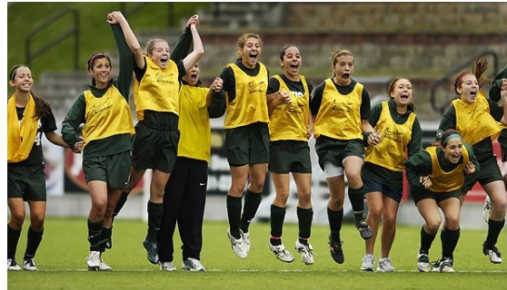
2003, 2006 STATE RUNNER UP